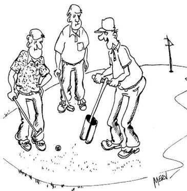
Well, if you can't move the ball closer to the hole, can you move the HOLE closer to the ball?