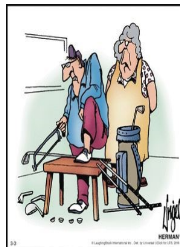
"Did you win?"